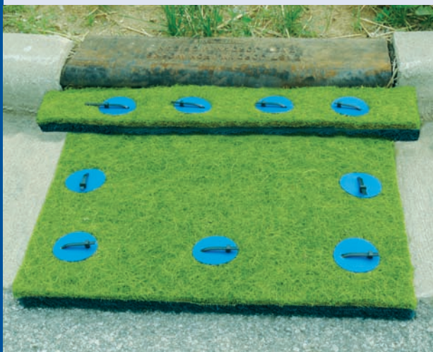
Shown above is the optional Sediguard™ Curbguard